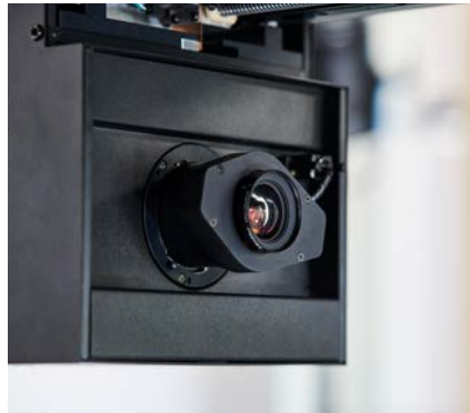
Camera system based on a CMOS sensor