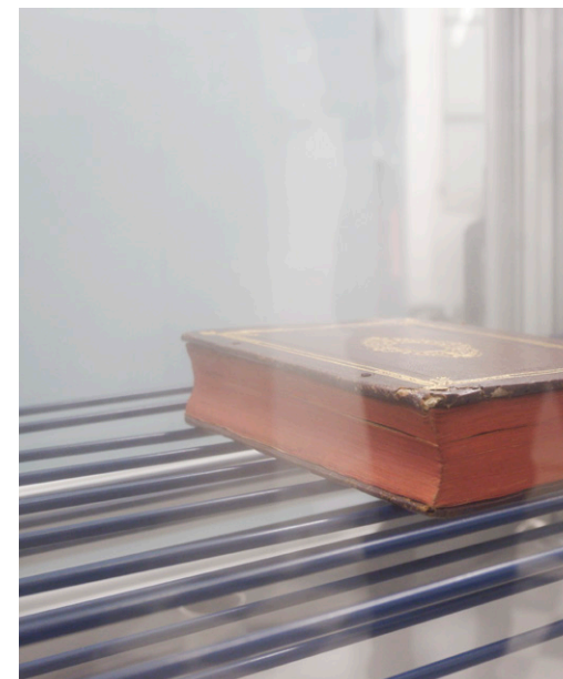
* Quaternary ammonium compounds

Nebula is the automatic machine for disinfection of paper material as books, newspapers, magazines, folders. The operating principle is to stop and chronize the bacteria, moulds and viruses through the biocidal action of QAC*.