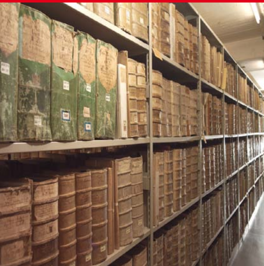
Step by step towards your digital library

Workflow software for large scale digitisation